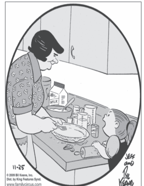
11-25 © 2009 Bill Keane, Inc. Dist. by King Features Synd. www.familycircus.com "This is a HARD way to make pumpkin pie, Grandma. Don't you know how to make the frozen kind?" JEFF and PAUL KEANE

Twenty Second 'Festival of Lights' Christmas Luminarias ~ Sunday, December 2, 5:30-8:00pm. Route begins at 14th and Central Avenue in Horton, KS. 20 living scenes of the life of Christ. Flyer is posted for more info.