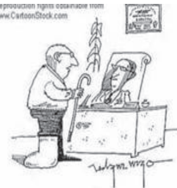
"I WANT YOU TO FILE A MALPRACTICE SUIT."