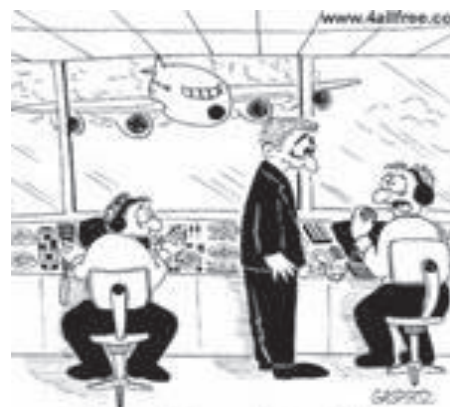
Oh-oh... Not a good sign. I just keep getting their answering machine.