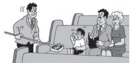
"I REALLY DON'T KNOW IF I SHOULD... JESUS DOESN'T LIKE MONEY-CHANGERS."