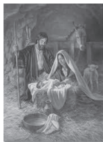
The Nativity of the Lord