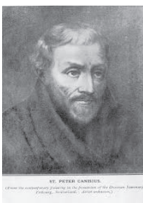
St. Peter Canisius, Priest

Christmas Choir Practice ~ Choir practice for Christmas Masses will be on Monday nights, Dec.19 at 6:30pm. New members are always welcome.