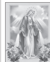
October, Month of the Rosary