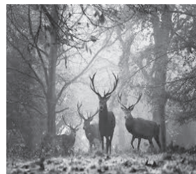
Deer in Autumn

The benefits of being a member of the Legacy Society: *Because the gift is made at death it doesn't take away from your retirement planning. *Leaves a great example of faith to your children. *Builds a strong financial future for our church and helps people experience the joy of Catholic philanthropy.