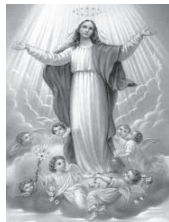
Our Lady of the Rosary Oct. 7th

The K of C will be handing out tootsie rolls at the front door of the church the weekend of October 10th and 11th. Free will donation. The proceeds goes to help people with intellectual disabilities.