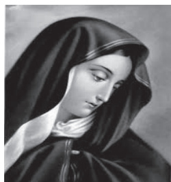
Our Lady of Sorrows September 15

Sept. 4, 2016 Collections: Plate-$53; Env.-$1,615; Cath. University-$10; Needy-$; LEAVEN-$21; Bldg. Fund-$824. Total-$2,523. *****