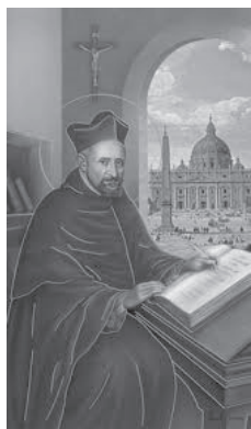
St. Robert Bellarmine September 17

Community Health Ministry ~ Our volunteer driver list is getting a little short! Getting our clients to and from appointments is a vital part of our volunteer services. If you are interested in helping us out, please give us a call, 456-7872