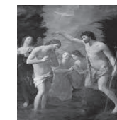
The Passion of St. John the Baptist

Price for the LEAVEN ~ The price of the LEAVEN subscription is $21.00 this yr. Please help defray the cost to the parish. Thanks!