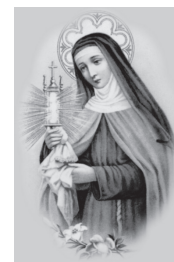
St. Clare August 11

The 4th Degree will have a business meeting August 20th at 7:30pm in the Immaculate Conception Church basement.