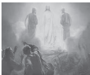
The Transfiguration of the Lord August 6th