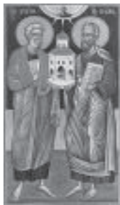
Saints Peter and Paul