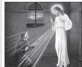
Our Lord's Divine Mercy

That you should dress up for Holy Mass because it is the most important event you attend?