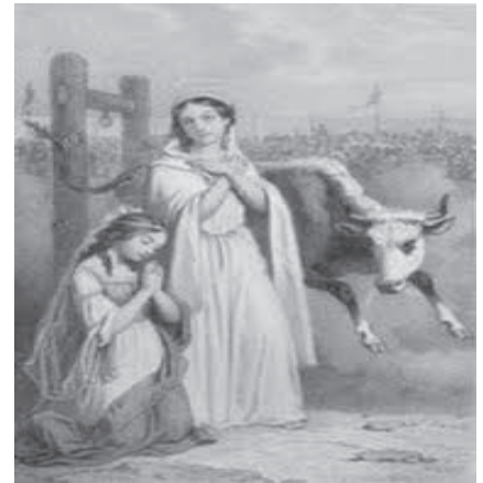
Sts. Perpetua and Felicity March 7th

Semi-Yearly Report ~ 7-1, 2014-Dec. 31- 2014: Income: $239,697.92; Expenses: $170,827.41