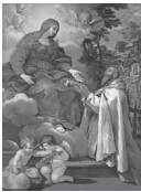
St. Peter Damian February 21st