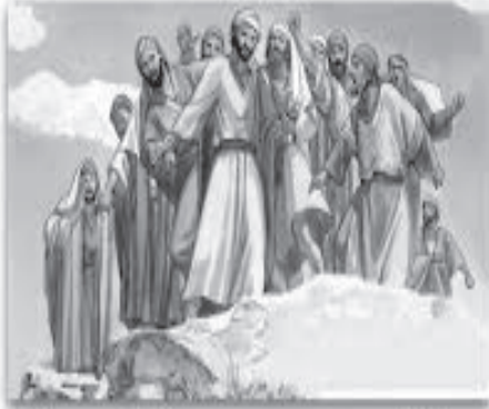
"Everyone in the synagogue was enraged. They sprang to their feet and hustled him out of town ..."