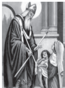
St. Blaise, Feb. 3rd- Martyr and Bishop