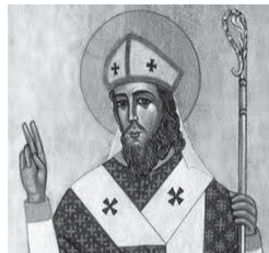
St. Hilary, January 13

Thank You, St. Stanislaus ~ Thank you to all who purchased Poinsettias for our Memorial Trees. Without your support the trees would not be possible. You may pick up your poinsettias after Mass on January 7th.