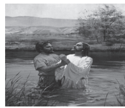
Baptism of the Lord January 8

Thank You ~ A big thank you to all who made it to the blood drive on Dec. 29th. We were within one unit of reaching our goal. Please mark your calendar for May 3rd for our next blood drive.