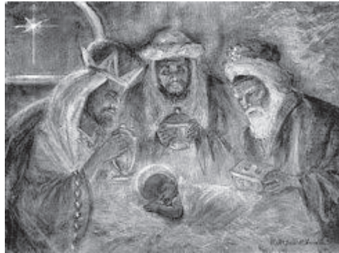
Epiphany of the Lord

Office Hours: Monday through Thursday 10:00am to Noon and 1:00 -3:00pm Friday 9:30am to 11:30am and 12:30pm- 2:30 pm