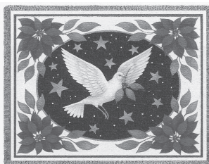
St. John Neumann, January 5